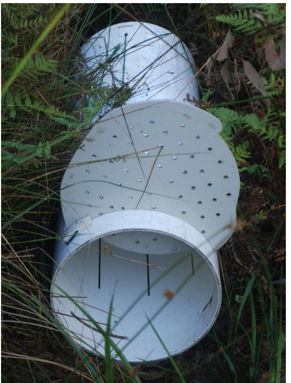
Figure 2: Tasmanian devil PVC pipe trap to be used for trapped foxes.