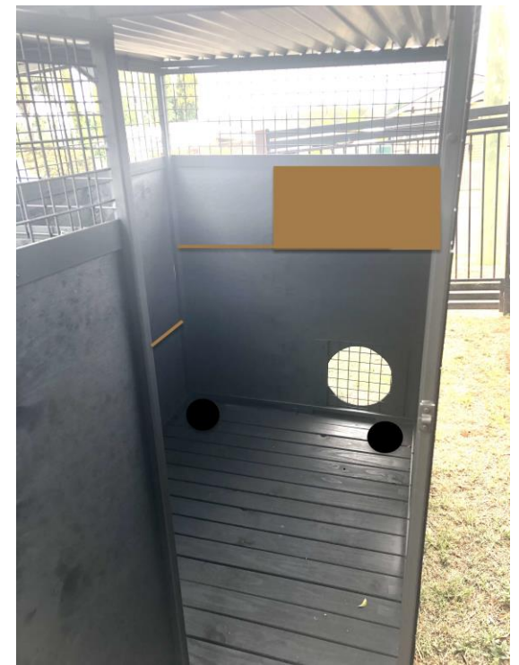
Figure 1: Inside view of prototype Vennel showing roof, ventilation mesh at the top of the wall, shelf and nest box, hole in the wall where the Tasmanian devil PVC pipe trap would be attached on the outside, and holes in the wooden floor for removal of faeces. This design has been modified, and the Vennel is bigger with an insulated overhanging roof and walls made from insulation panels used for cool rooms.